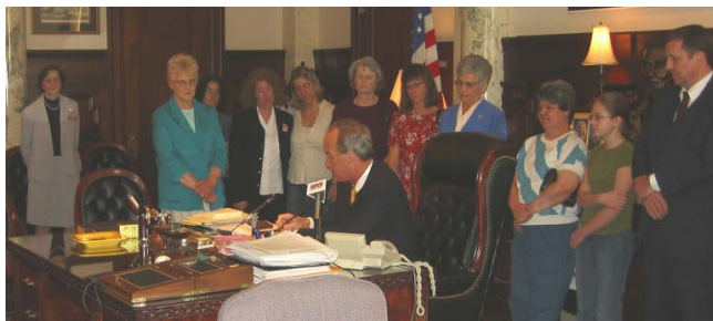
Governor of Idaho, Dirk Kempthorne, signing the defacto custodian bill.