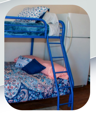
Haven remodel by community members