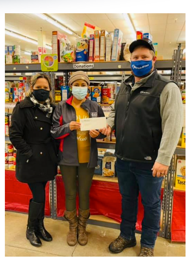
Rexburg Outreach Office