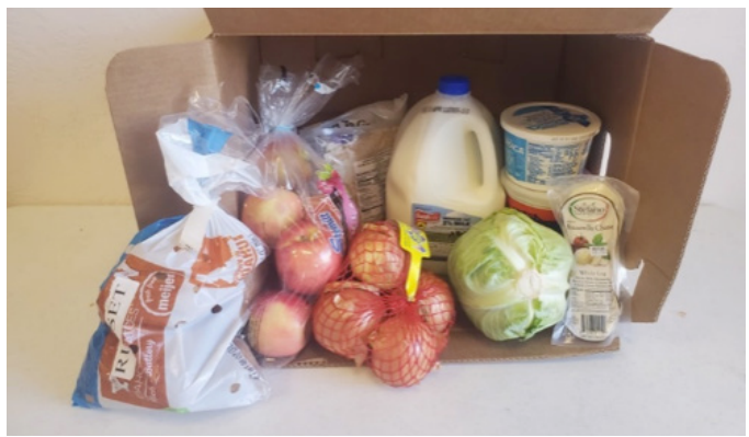
Farmers to family food boxes given to local residents