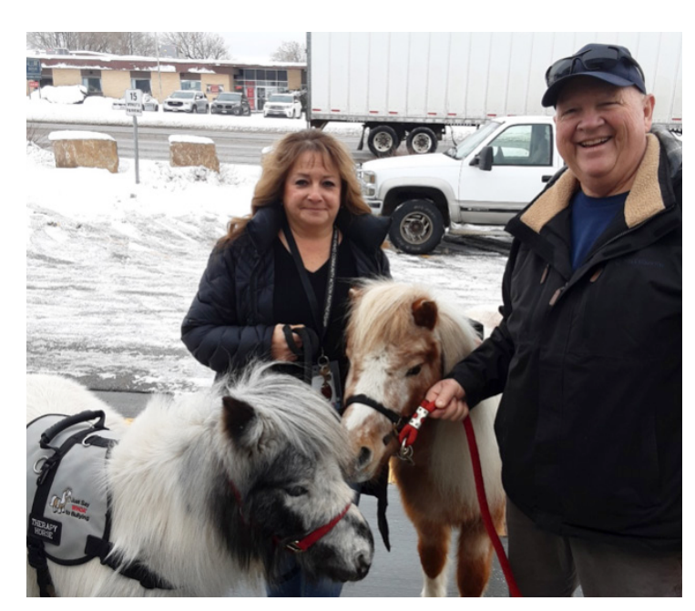
Pony day at the West center!