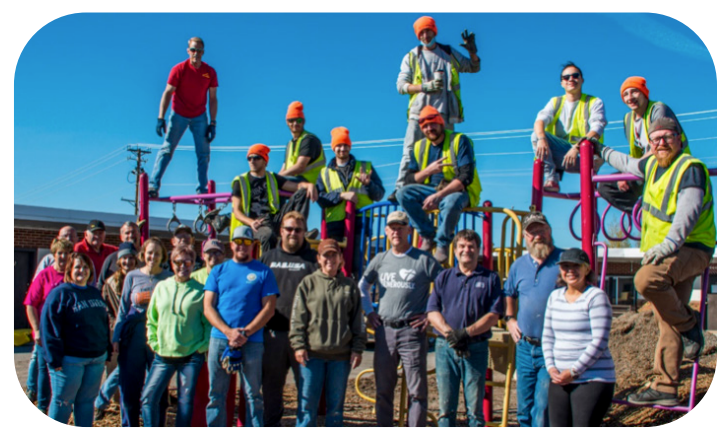
Haven Shelter Improvements