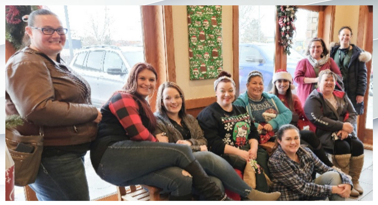
The Head Start Central office crew!