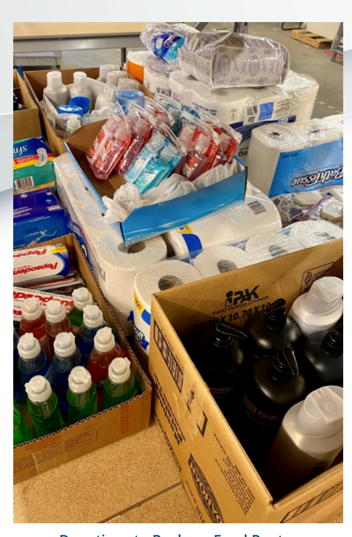
Donations to Rexburg Food Pantry