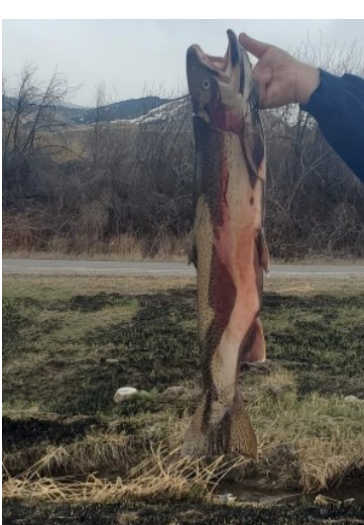
Steelhead salmon distributed to residents