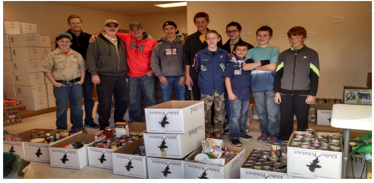
Boys Scout Food Drive