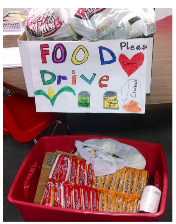
Senior Project Food Drive