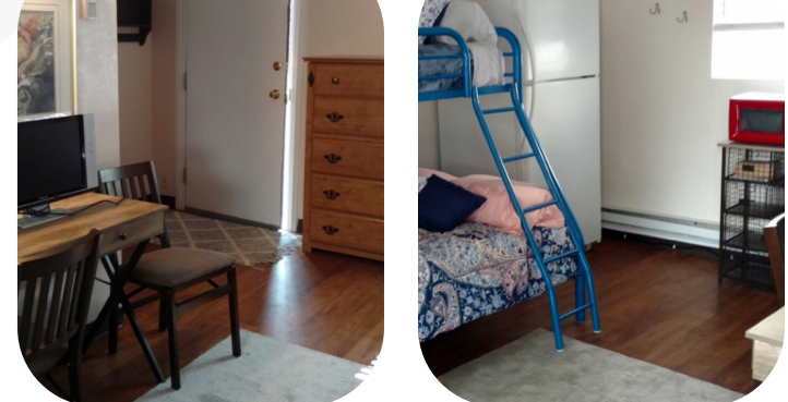
A Haven room remodel by community members

The Haven was a starting over point for my son and I. But it wasn't just a destination to temporally stay, it was our home. It was our foundation for a new life and an experience to build from. The Haven, and the amazing woman who run it, not only provided us with shelter but the support and the guidance to help get me back on my feet, to reunite me with my son, and to make a life that is worth living.