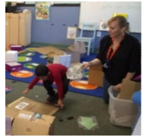
Ms Katrina exploring building materials