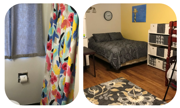
A Haven room remodel by a local high school senior