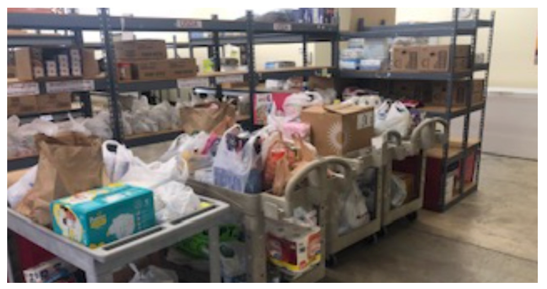
Donations to Rexburg Food Pantry