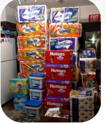
Donations to Haven