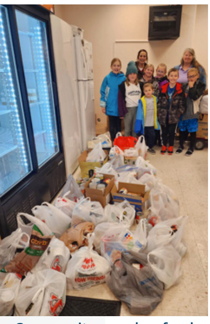
Community member food drive