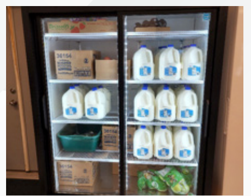
Refrigerator donation from Dairy West for Food Pantry