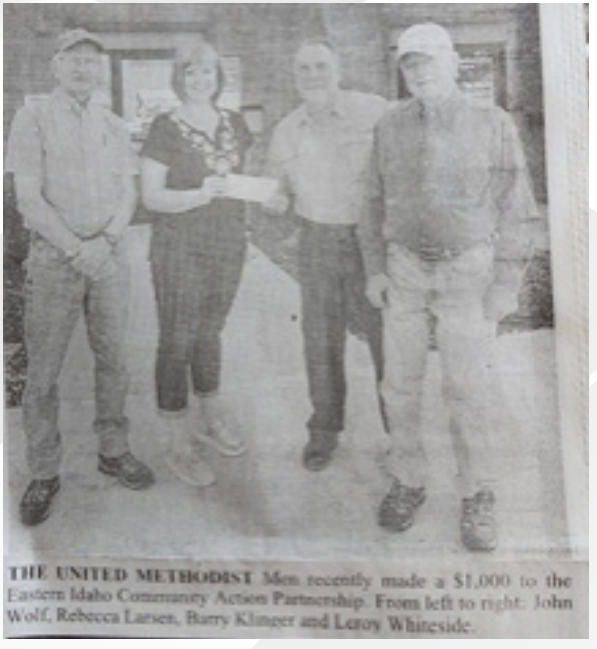
Newspaper for Donation to Food Bank