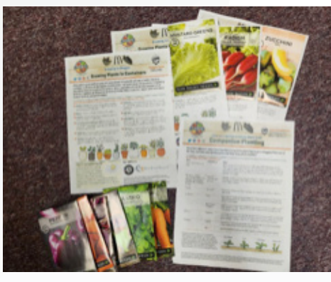
Seeds donated for Food Pantry clients to grow their own food