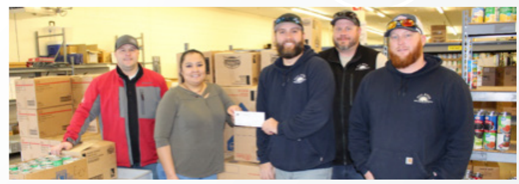
Fall River Electric donation to the Rexburg Food Pantry