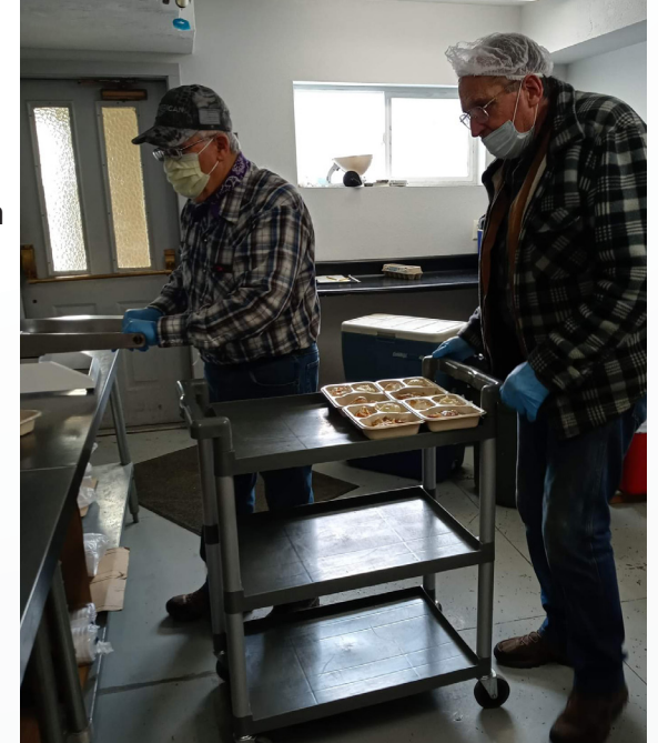
Ririe Senior Center meal preppreparation