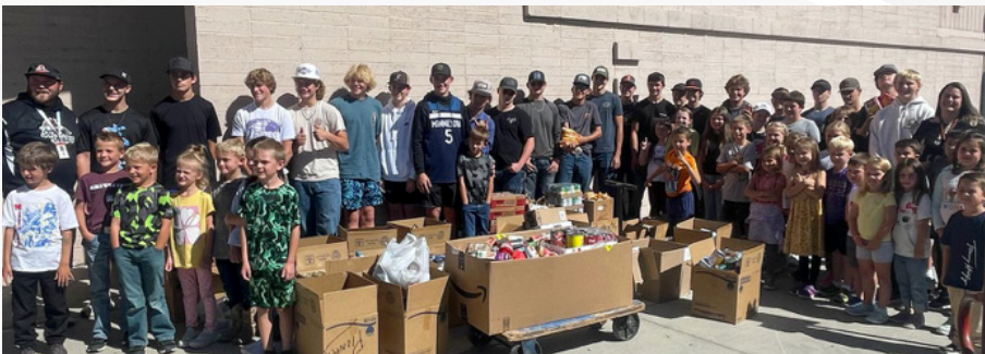
Salmon Food Drive Donation