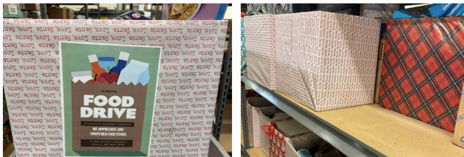
Food Drive from BYU students