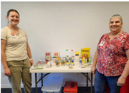
Salmon nutrition class