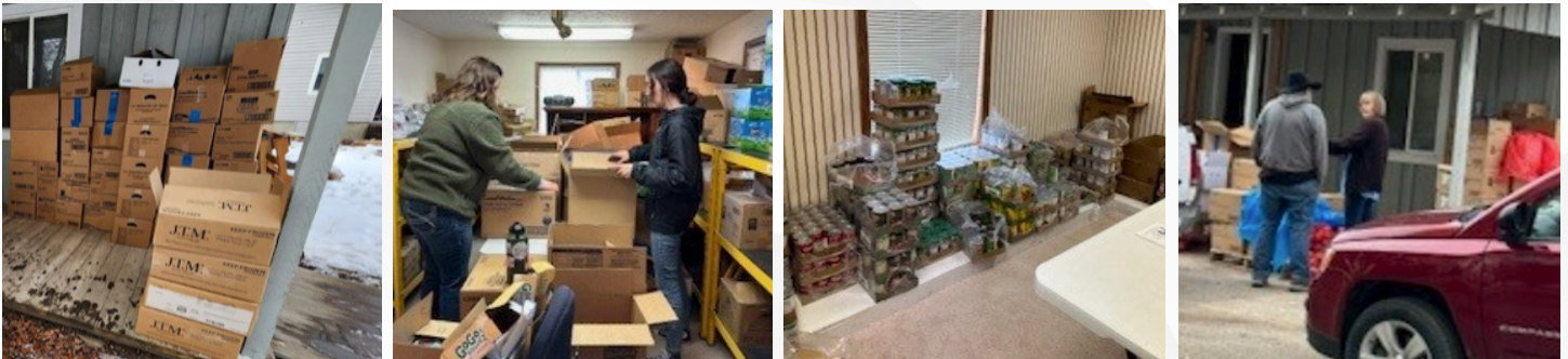
Challis Food Pantry