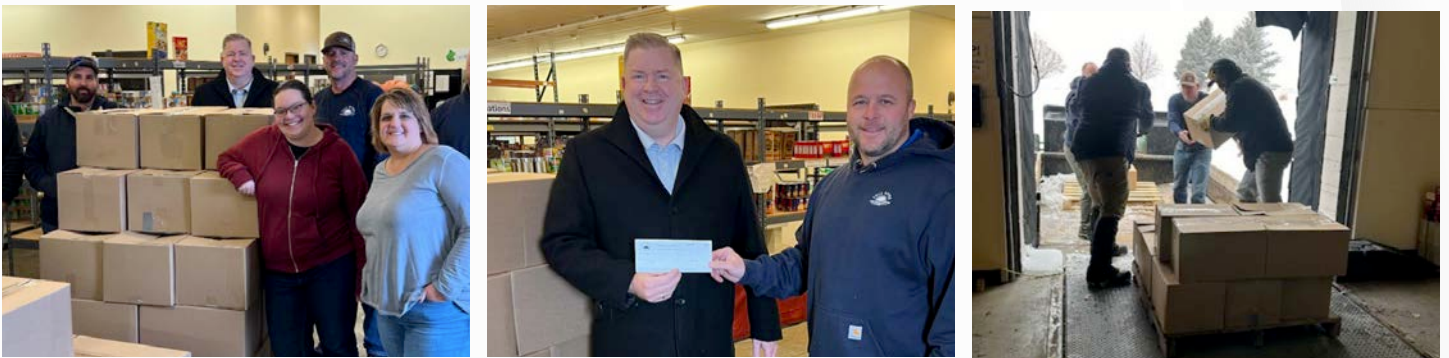
Fall River Electric donation to the Rexburg Food Pantry