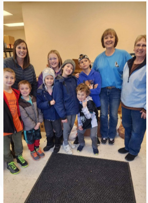
Salmon Food Drive Donation